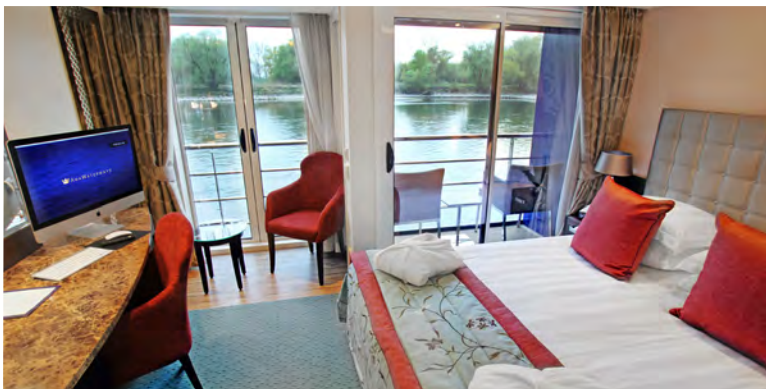
Length: 443 ft. • Width: 38 ft. • Crew: 51 Staterooms: 81 • Passengers: 162